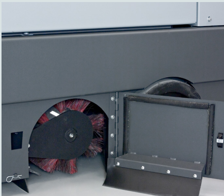
Easy inspection, maintenance and replacement of the brush is possible thanks to no-tool-needed access