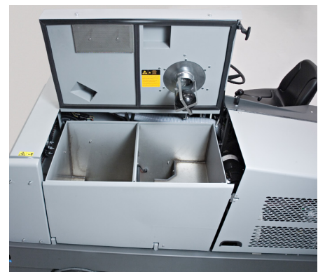
The recovery and solution tanks are squared and made of stainless steel. This allows them to be easily cleaned and it enables the use of hot water for better floor cleaning