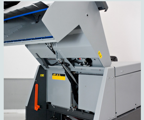
The CR 1500 can dump debris at a height of 152 cm